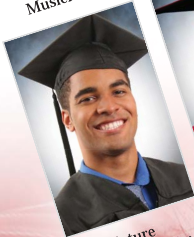
Future Physical Trainer