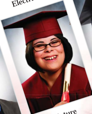
Future Pastry Chef