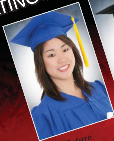
Future Police Officer

CELEBRATING YOUR PAST. CREATING YOUR FUTURE