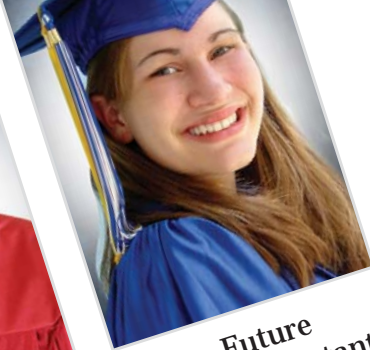
Future Office Assistant