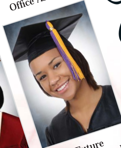
Future Health Care Worker