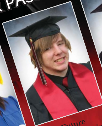
Future Auto Mechanic